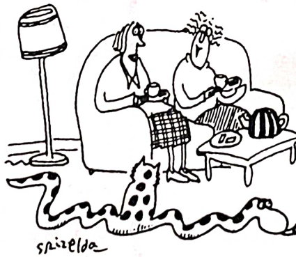
'How is the cat getting on with your new pet snake?'